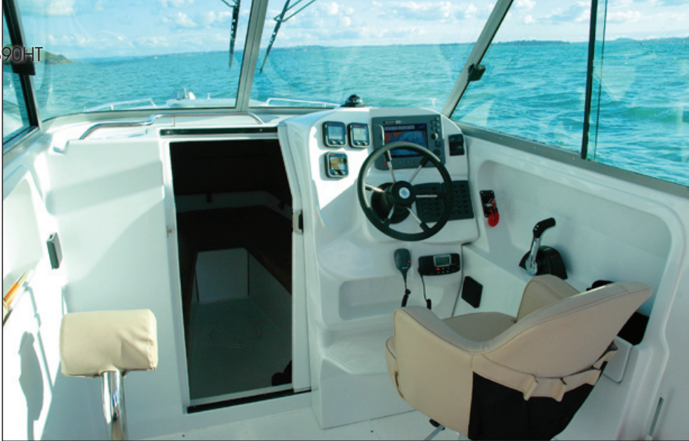
The helm area is clean and tidy, extra ventilation is provided via large sliding side windows.

The boat arrives as a bare hull, fitted with the Hypalon tubes. The hardtop