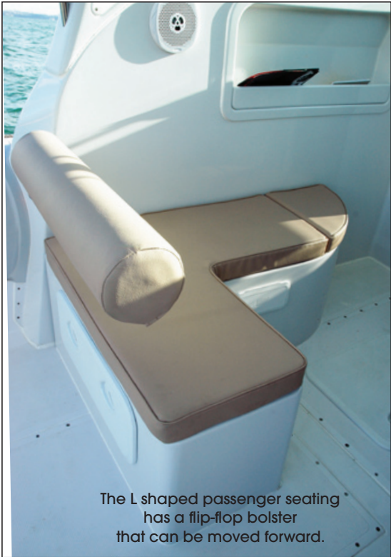
The L shaped passenger seating has a flip-flop bolster that can be moved forward.

All the Gemini models are built pretty tough; this particular boat is built with military grade Hypalon for the tubes – in fact the tubes are doubly strong, having two skins of Hypalon. Additional features on the tubes include blow off valves which means that as the air pressure inside the tubes increases with the warmth of the sun it will allow air to escape, lessening the stress on the seams.