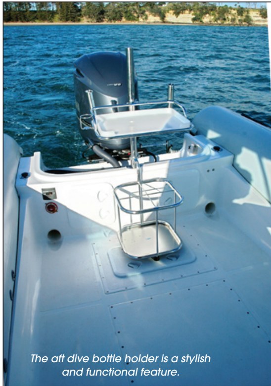
The aft dive bottle holder is a stylish and functional feature.

A hatch on the foredeck provides offers extra light and ventilation whilst also providing access to the anchor locker and helm operated freefall winch, another of the features that is built into the Gemini when it arrives in New Zealand. When you need to