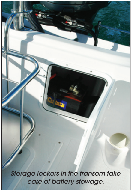
Storage lockers in the transom take care of battery stowage.

Passenger seating consists of an L-shaped settee setup with storage space underneath. Assault Boats has also fitted a bolster insert for passengers to lean against whilst standing and facing forward when underway.