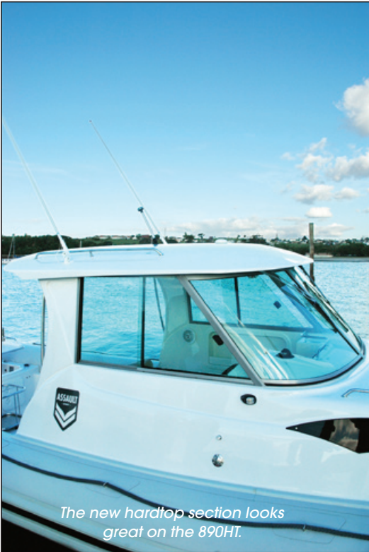
The new hardtop section looks great on the 890HT.

Overall, I loved the 890HT. But it wasn't