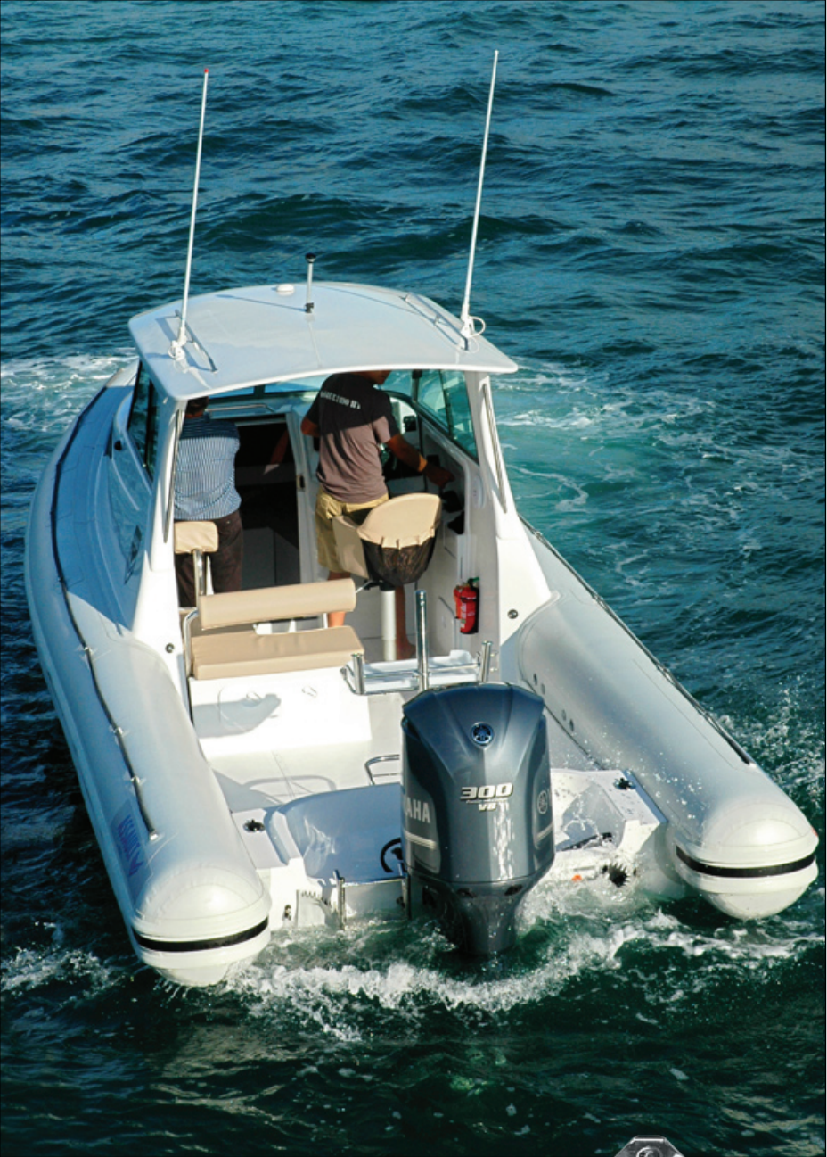
The enclosed hardtop is a great feature, and will be popular during the winter boating months.

so many years ago that RIBs were strictly for big boat tenders, divers and rescue organisations. Anything over 5m was a big boat and most were open centre consoles or at best featured small cuddy cabins. How times have changed and while the full cabin RIB is still only a very niche market, it is without doubt growing and the new 890HT fits that niche perfectly. It's one of the few RIBs or GRP boats on the market that will allow you to customize the internal layout for seating.